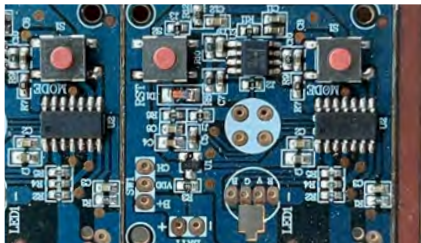
Cutting Circuit Boards