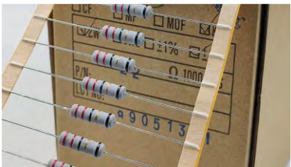
Horizontal Taping Elements